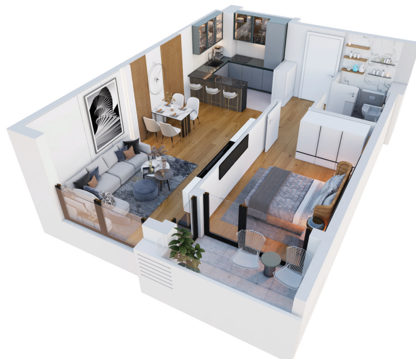
3D prikaz stana