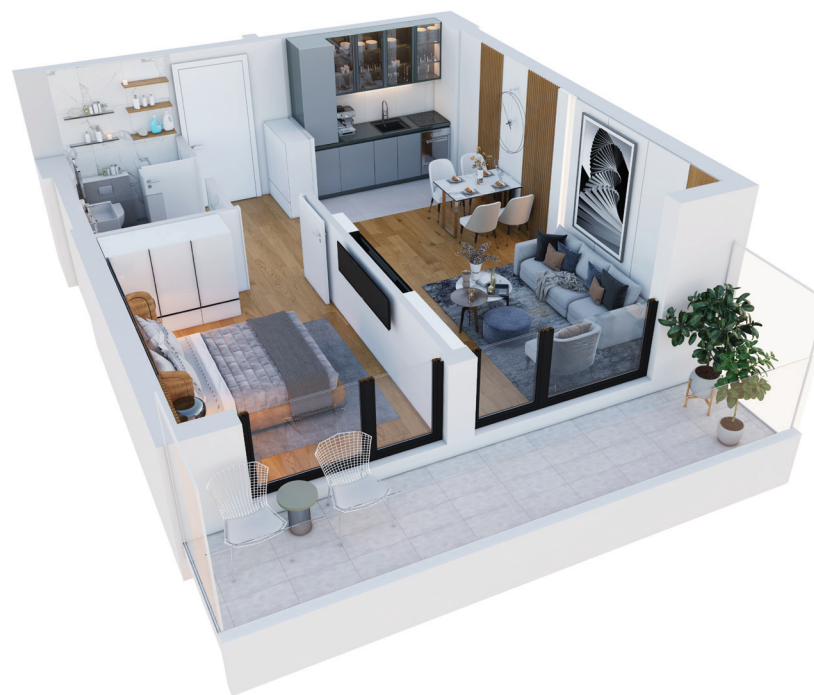
3D prikaz stana